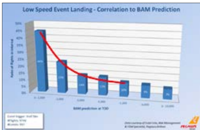
Figure 3. The same shape of acceleration in risk, or decrement in human performance, observed in FDM data (ratio of low speed events) when correlating with predicted alertness for almost 10,000 flights.

The conclusion to draw is that a predictive metric capturing fatigue risk should also include a risk contribution from much lower levels of predicted sleepiness than those close to, or passing KSS 8. Human physiology, when being predicted into the future, does not have sharp thresholds separating safe from unsafe. The probability of an accident accelerates more slowly, and from lower levels, when sleepiness is predicted, compared to the risk development observed for self assessed sleepiness. Figure 3 is based on FDM data and tells a similar story.