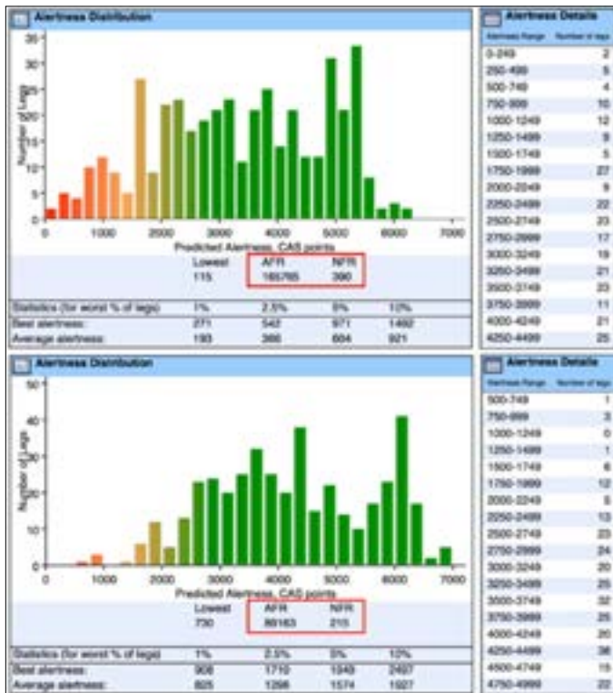
Figure 4. Scenario A (top) and scenario B (bottom) with the same set of flights planned in two different ways into crew rosters.

Figure 4 shows how the same set of flights have been planned in two different scenarios, but with a clear difference in risk. Both scenarios respect the same planning rules but we can, by just looking at the distributions, quickly confirm that scenario B is preferred as the risk is much lower. This is visible as there are fewer flights in the left tail distribution in scenario B. Our AFR and NFR metrics confirm the same but also quantify the risk has been reduced by 45%.