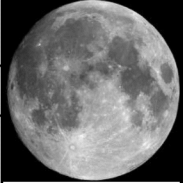
APOLLO 17 (Dec 1972)

"I took my first steps to the moon at Purdue University." "The Navy has been my life - all my life." "The only things that matter in life are Family, Friends and Freedom - and time to enjoy all three."